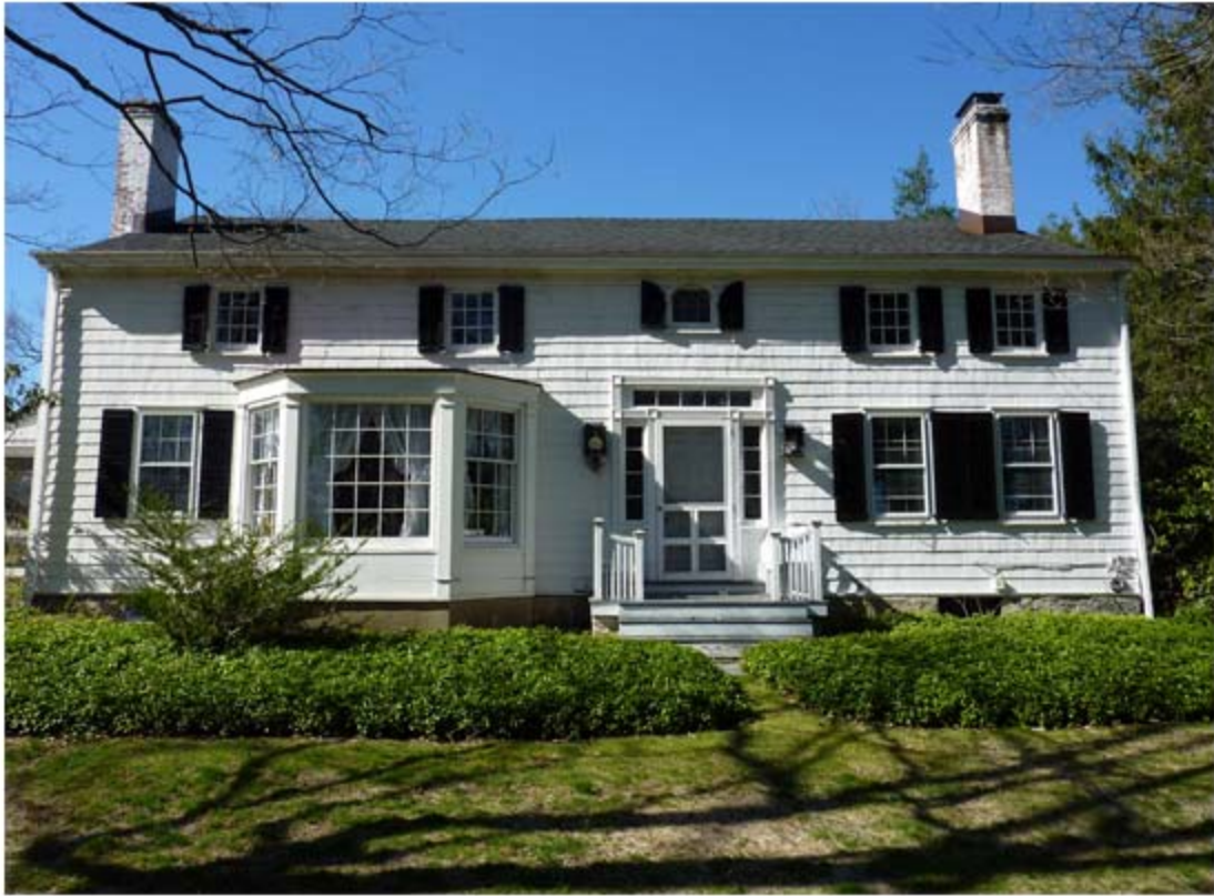
Third house on tour