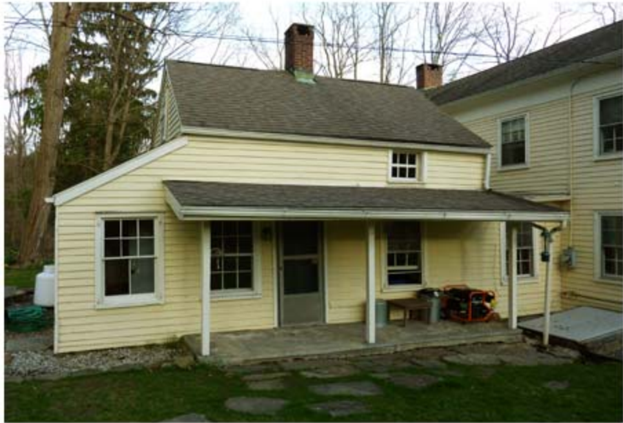
First house on tour