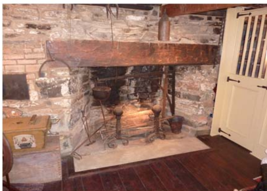
Second House on tour