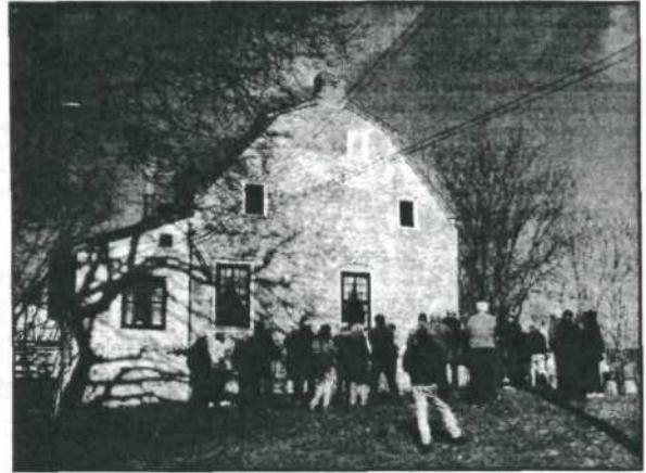
Van Schaick Mansion Cohoes Island, Albany County, NY