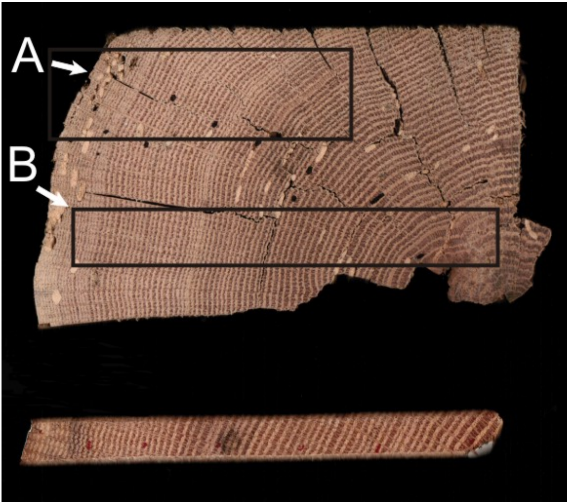
Figure 1. A cross-section of an oak timber with sapwood rings on the left-hand side (above). The boxes illustrate conversion methods resulting in A ) a precise felling date and B ) a terminus post quem or felled after date. Also pictured is a core showing complete sapwood (below).