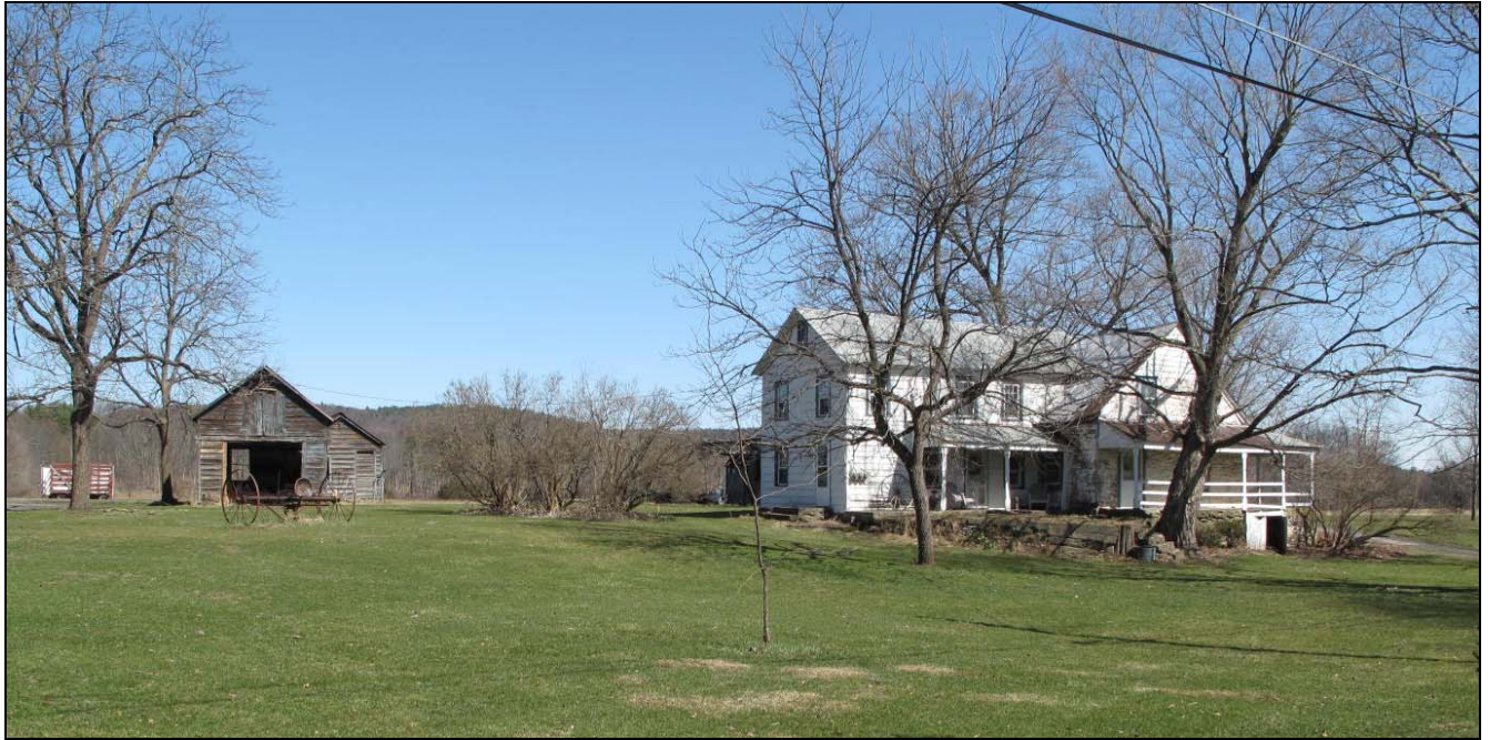
View of Osterhoudt Home Farm house, wagon house and setting from southwest

OSTERHOUDT HOME FARM 167 Lower Whitfield Road