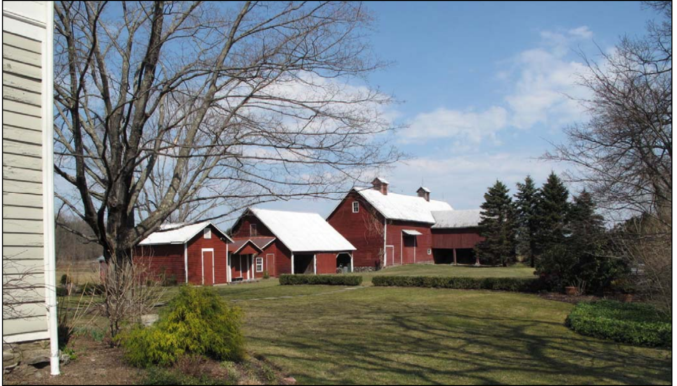
View of farm buildings from SE.

THOMAS S. SCHOONMAKER FARM 607 Kyserike Road (County Route #6)