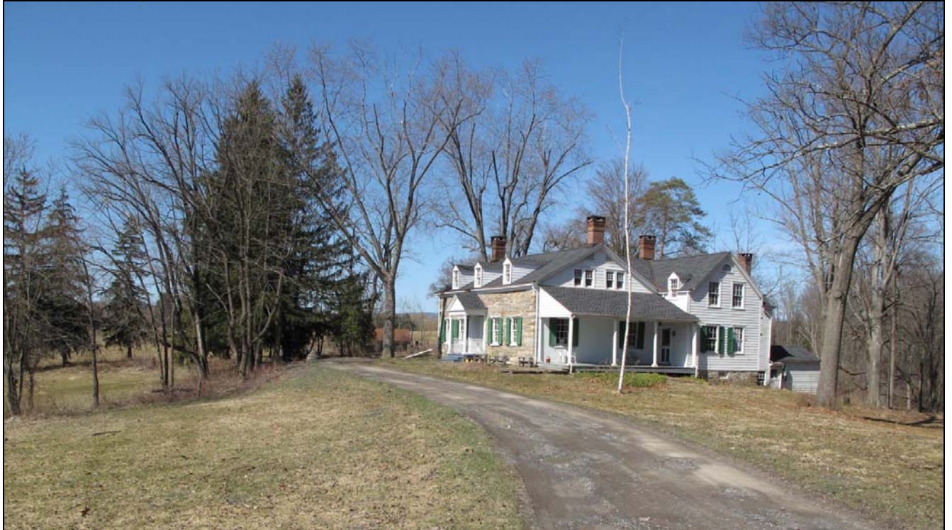
View of Appeldoorn stone house, 1756 & 1937 and setting from southeast

The building compound is set back from the public road reached by a picturesque tree-lined lane. Two massive cut limestone posts frame the entrance, once having gates now gone. A mid-19 th -century wood frame tenant house, with a wide front dormer in the Gothic taste that then pervaded the region, stands sentry west of the gateway. The lane runs perpendicular to the highway, bending westward at the vanishing point to approach the house. On the east side of this curve, Howard C. Sykes built a stone “Game House” with a great room to contain the trophies he had collected as a big-game hunter. Stones and timbers from the nearby DeWitt house, which the Sykes brothers bought with 80-acres of neighboring land in 1937, were used in the construction. Kingston architect, Myron Teller, who had made a name for himself with creative Colonial Revival-style “restorations” of stone houses in the county, modeled the recreation building after the nearby Schoonmaker house. After bending westward, the lane emerges from its wooded setting into an open vista with an expansive field stretching south- and west-ward. Midway in this vista, on a ridge above the floodplain of the North Peterskill is the old stone house with dramatic views in every direction.